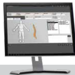
Image Suite V4 Software