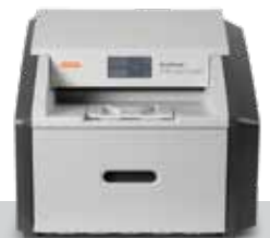
DRYVIEW 5700 Laser Imager