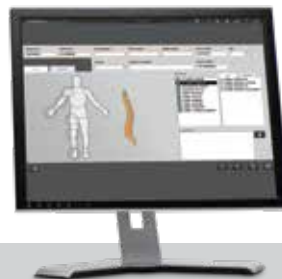
Image Suite V4 Software