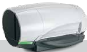
Vita Flex CR System